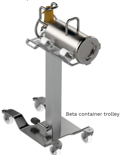
Beta container trolley